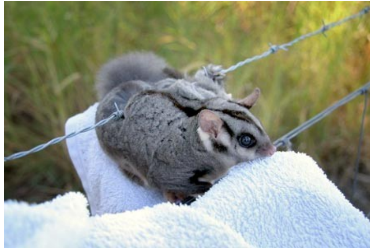
Photo above by Louise Saunders, not a Mahogany glider, a sugar glider

The Mahogany Glider of far north Queensland is listed at both the federal and state levels as endangered. There have been 10 taken off fences in the last decade, 5 of which died, 2 released and 2 in captivity and 1 currently in care. Daryl Dickson's experience with these animals has shown if the damage is not too severe, the membrane will heal remarkably well without stitching. As with all other species, no one is aware of the real number entangled by fences.