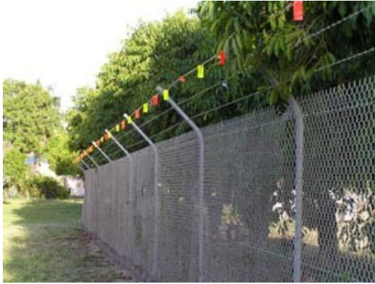
Army Barracks Townsville.

Metal plates have been installed between the top two barbed strands atop a cyclone mesh fence around a power substation in the Pilbara. In this case, barbed wire was required since substations should meet Australian Standards regarding the Restriction of