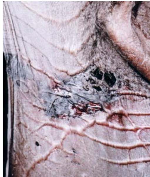
The dieback that occurs some days after rescue. The resulting slit will make it impossible for this bat to fly.

The Little Red flying foxes are affected more than the 3 larger species of flying foxes, presumably as their flight is weaker in windy conditions. It is not uncommon for large numbers of Little Red flying foxes to get caught over a few weeks, especially when the young cannot fly well enough to cope with windy conditions. On the Atherton Tablelands, these mass events usually occur in August to October. In 1994, 442 Little Red flying foxes were caught, mostly along one 10 km stretch of barbed wire. Little Reds occur across northern and eastern Australia extending inland long distances depending on the availability of flowering trees.