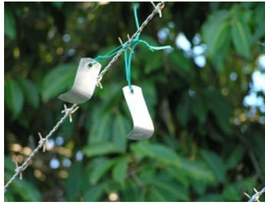
Metal tags.