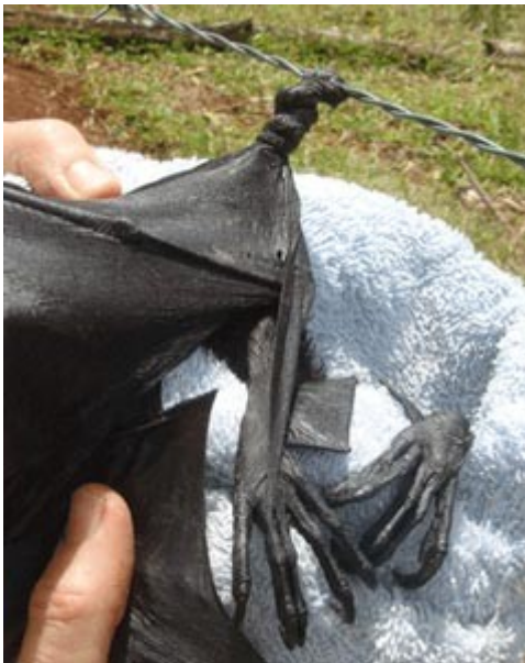
The twisting that can occur. Note barbs have been removed before trying to remove bat from fence.

Do not be tempted to rescue the bat and let it go. There is usually a die-back process in the wing that may not be evident for several days. The damage may look quite minimal at first, but lack of blood supply to the wing while it is still entangled can lead to a surprising amount of die-back, or loss of wing membrane