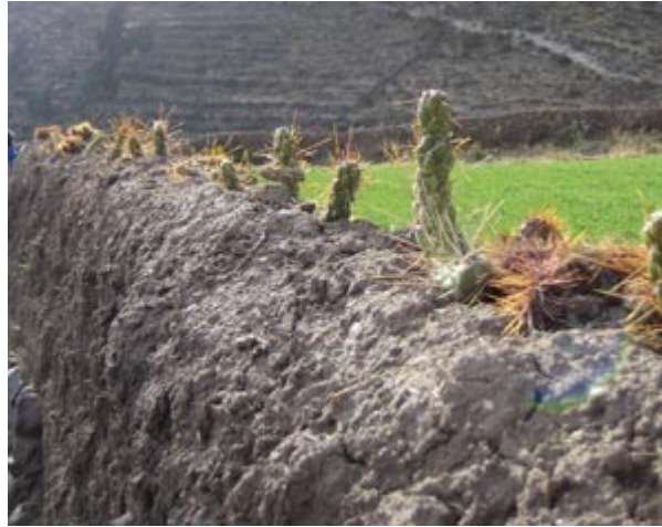
Keeping people out in South America

The WWF will involve the following activities: