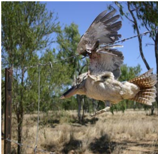
Kookaburra

Owls and other birds often fly into the top strands of these types of fences and are then caught in the barbs, unable to struggle free, and so frequently dying slow, agonising deaths. The Birds of Prey Working Group is investigating various methods to make fences more visible, in particular to nocturnal birds, and this will prevent countless unnecessary death'. Endangered Wildlife Trust, South Africa