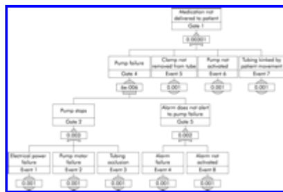
Figure 3 A complex fault tree that incorporates human error into the design of the PRA.